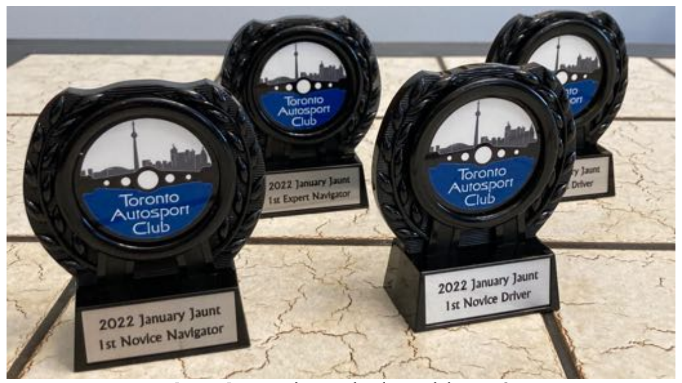
January Jaunt awards are ready to be awarded... to you?

Navigational rallying is back! January Jaunt Car Rally registration opened on the weekend, and it looks certain that the event will run on the revised date of March 26. Navigational rallies are friendly to beginners, experts, and everyone in between. If you try it and do well, there are awards!